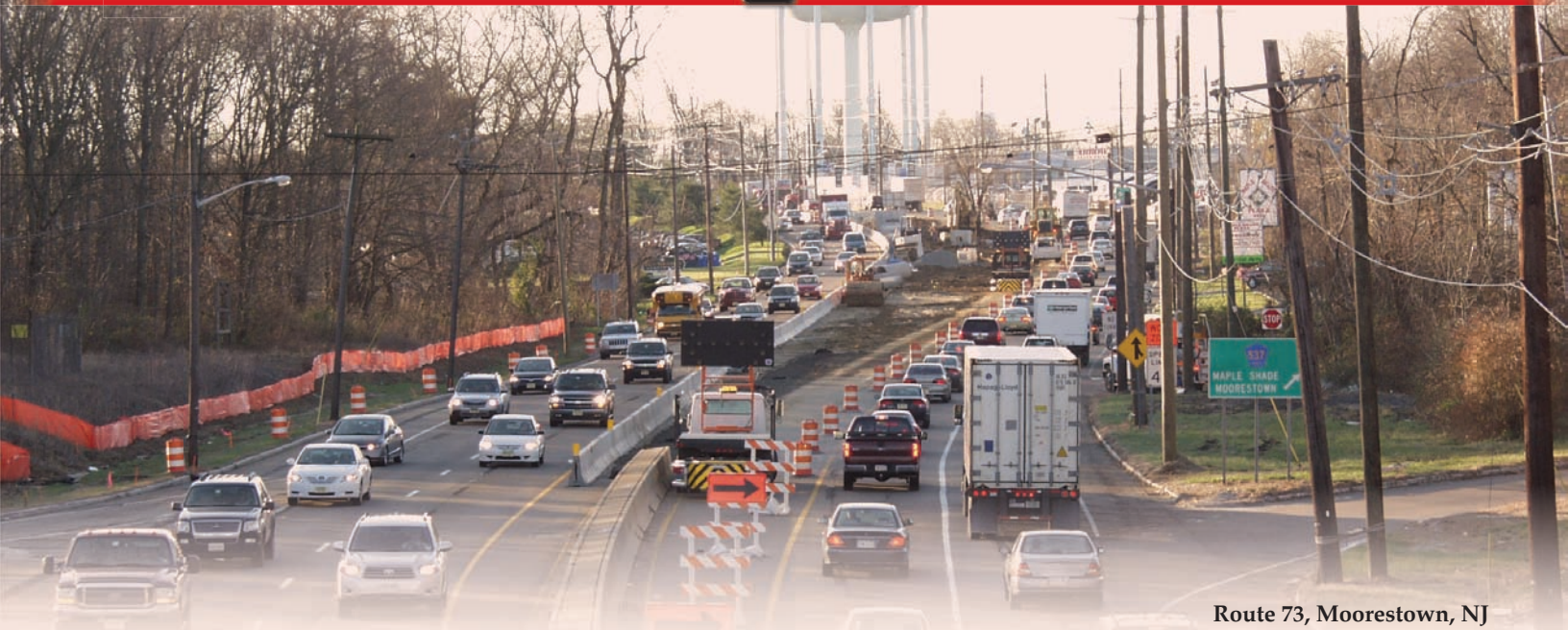
Route 73, Moorestown, NJ