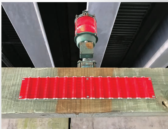
Retroreflective panel on bridge pier costs approximately $15 and eliminates U.S. Coast Guard penalty of more than $29,000 for a malfunctioning light