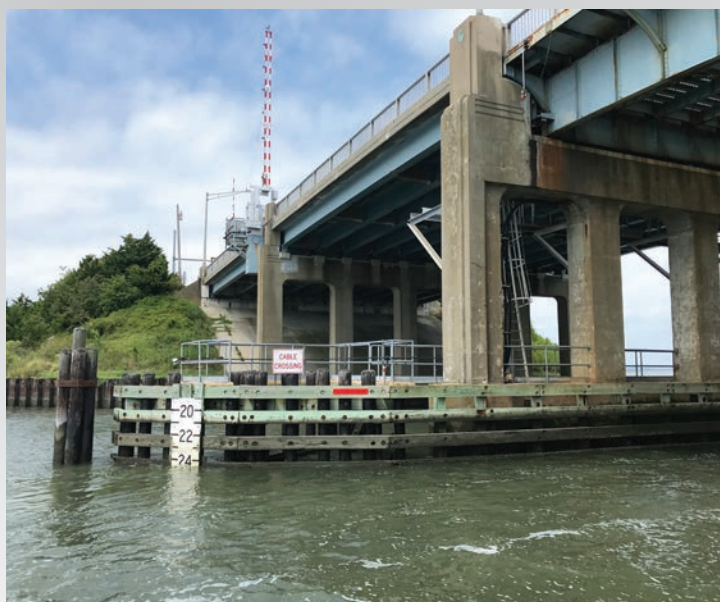
Retroreflective panel on Route 47 over Grassy Sound provides delineation of navigable channel in all weather conditions