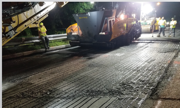
Della Pello Paving, Inc. was contracted to resurface and rehabilitate 12.4 miles of pavement on Route 22 eastbound in Hunterdon County and Somerset County.