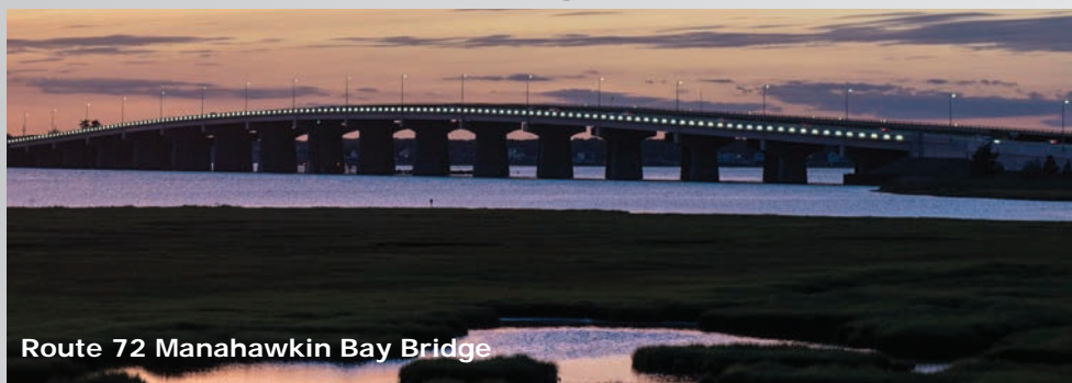
Route 72 Manahawkin Bay Bridge

In September, AASHTO named two NJDOT projects regional winners in the 2020 America's Transportation Awards competition. The Route 72 Manahawkin Bay Bridges Project Contract 4 won best Quality of Life/Community Development ; and the Route 280, Route 21 Interchange Improvements Project won best Operations Excellence .