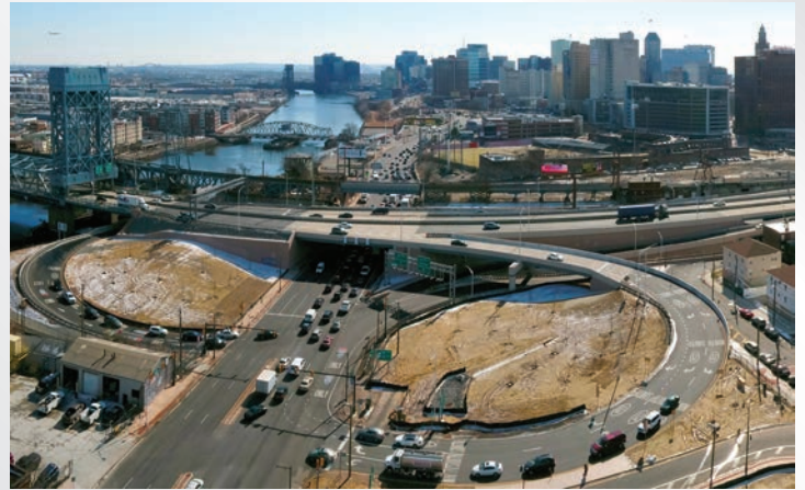
Route 280/Route 21 Interchange Improvements Project, Newark NJ. AASHTO Operations Excellence regional award winner

The project built four new bridges, rehabilitated two additional bridges within the interchange, and upgraded existing infrastructure, such as highway lighting, traffic signals, signing, and landscaping. In order to improve traffic flow, the project also eliminated two direct ramps onto I-280, and constructed shoulders to widen the lanes.