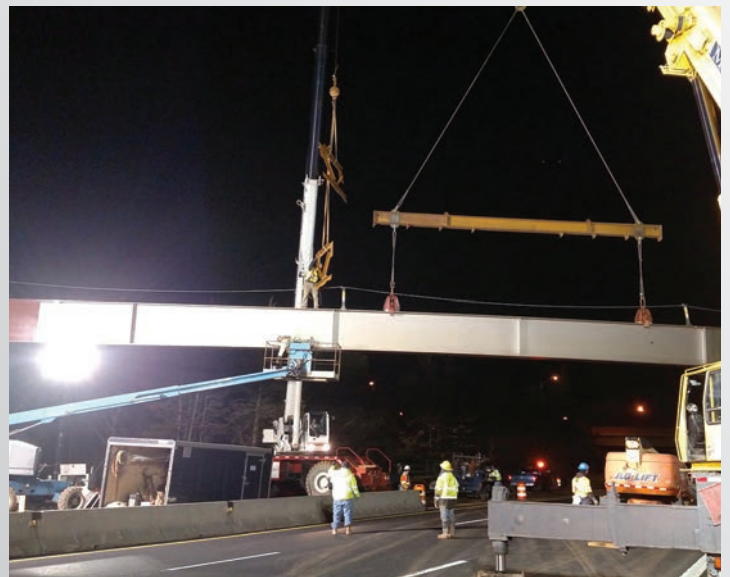
Overnight steel erection for a bridge over I-287

In addition, the project realigned the ramp from I-287 northbound to Routes 202/206 southbound to reduce the possibility of exiting traffic backing up