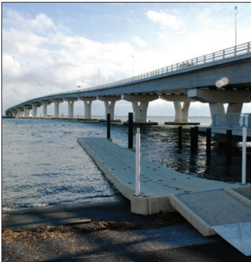
Route 52 Causeway