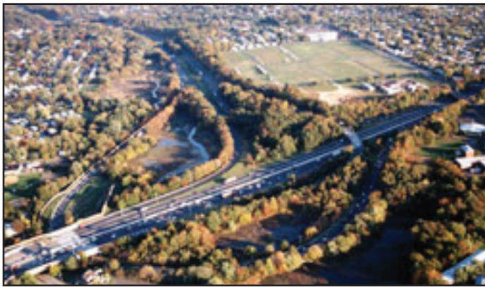
I-295, Route 42 and I-76 aerial at 'Aljo' curve.

The current configuration, one of the true head scratchers of patchwork design confusion in New Jersey, requires I-295 motorists to exit the interstate and weave across other congested highway lanes to return to I-295. The Direct Connection project will eliminate dangerous merge conditions by building a viaduct that carries I-295 traffic over Route 42 and I-76.